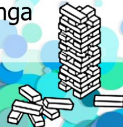
Table Tennis Connect 4 Giant Jenga